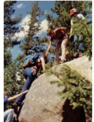
SOAR students displaying patience and perseverance in the field.

SOAR is entering its 31 st year and enjoying the maturity and success of an organization in “young adulthood”. Our son, the quintessential experiential learner, just celebrated his 19 th birthday and is still embracing the challenges and opportunities of life as a college freshman. As I reflect back over the many years as a father and executive director, I realize there are many traits contributing to these present successes. The short list would include being an effective listener, staying solution focused, spotlighting strengths, remaining goal oriented and maintaining a sense of humor. Some of these traits were innate and honed over time. Others were completely alien and developed over the many years through patience and perseverance.