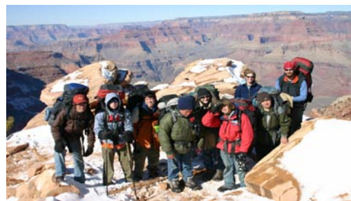
Group One at the Grand Canyon!!