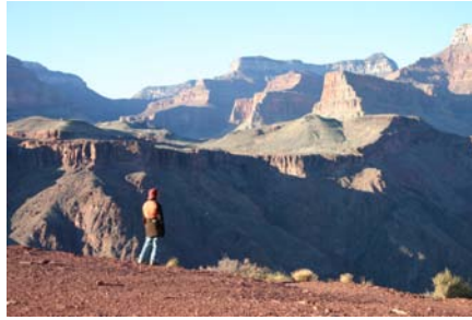
Taking time to look at the beautiful scenery.

In the new era it's a Toyota Tacoma from 2005 or older with 4 wheel drive, extended cab, and TRD package. In the old era of vehicles that I like is a international scout 2.