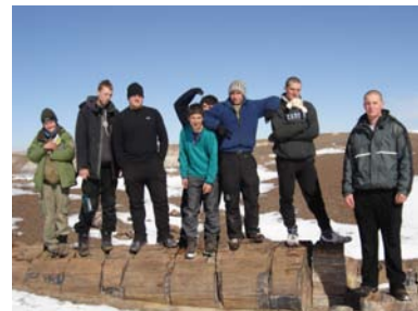
Group Two Hanging out !