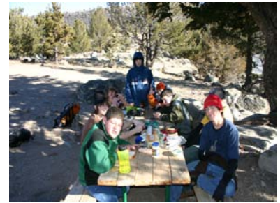
Group One eating a nice expedition meal.