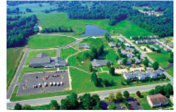
The campus of Brehm Preparatory School.

We have had quite the winter here at SOAR- including record cold and a few storms that left over a foot of snow covering our base camp! Needless to say, we are more than ready for summer to start and for kids to begin arriving.