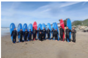
The Southwest team surfing in California.

The Southwest team has explored everywhere from the Grand Canyon, Lost Dutchman State Park, and the Petrified Forest National Park and then flew to Texas to experience Guadalupe National Park, Balmorhea State Park, and Big Bend National Park. The team has just completed their first of two fourteen day trips to California, advancing their climbing abilities at Joshua Tree National Park and then spending some time at the Channel Islands National Park. The team's final expedition will be to SOAR's Eagle View Ranch in Wyoming. Every member of the South West team, with the exception of 2 new students, has completed a previous SOAR semester, and has used their experiences to produce a very strong team dynamic.